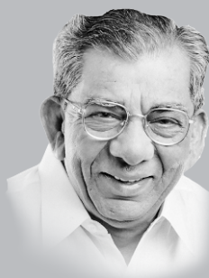
Dr. Shamanur Shivashankrappa