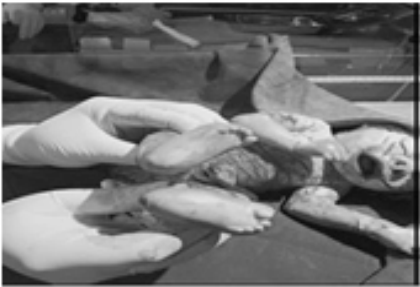
Fig 2: The fingers and toes were flexed and fixed flexion deformity, incurved toes, short foot length and clenched fist typical of Harlequin fetus