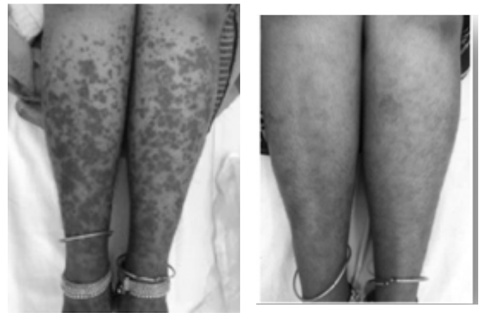
Figure 01: Before starting Dapsone, Figure 02: After 3 days of dapsone therapy.