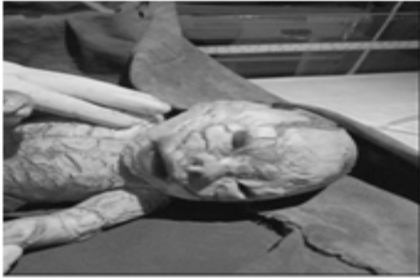
Fig 1: Showing Harlequin fetus with characteristic clown like facies, with ectropion, eclabium and under developed nose. Note the coat of armour like appearance with shiny plates and fissures