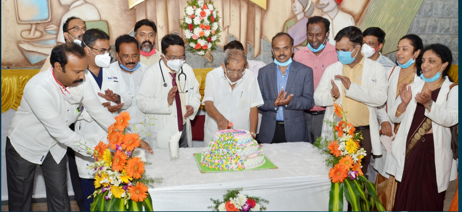
Inauguration of COVID - 19 LAB

Official Quarterly News Bulletin of SSIMS&RC