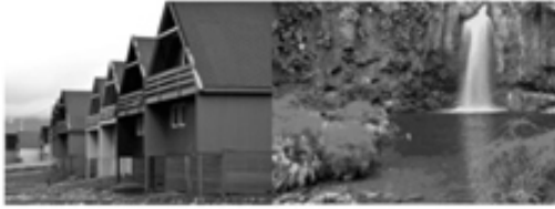
The houses are so colourful